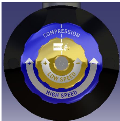
Dual Speed Reservoir Adjuster